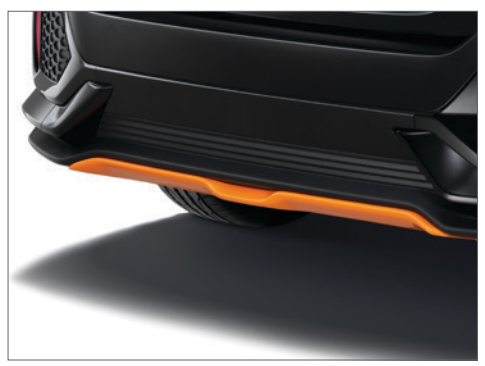
TUSCAN ORANGE REAR UNDER SPOILER