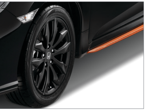
17" MODULO ALLOY