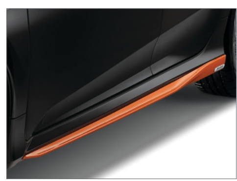
TUSCAN ORANGE SIDE UNDER SKIRT