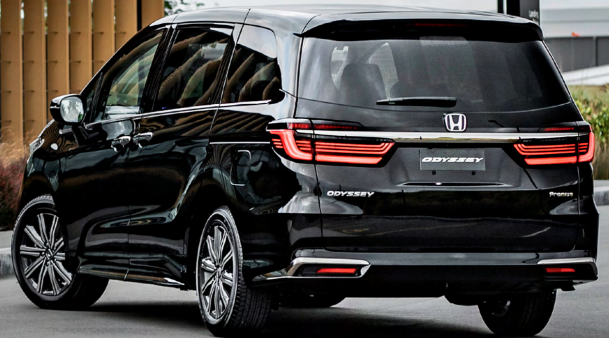
PREMIUM SPARKLE BLACK PEARL