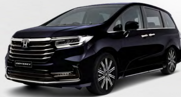
PREMIUM SPARKLE BLACK PEARL