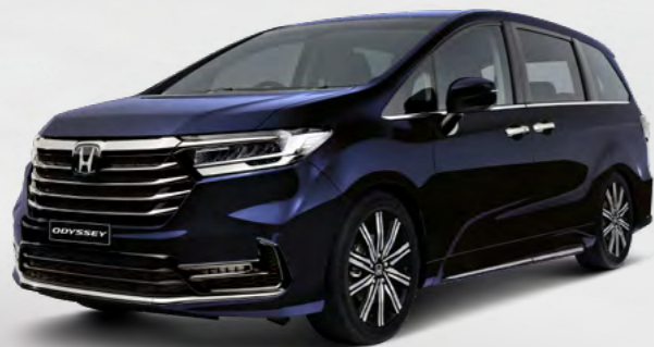
OBSIDIAN BLUE PEARL