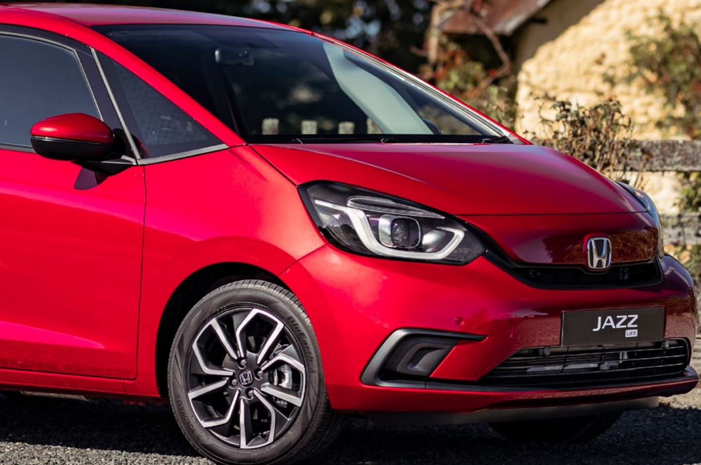
Model shown is the Jazz 1.5 DOHC VTEC petrol engine.