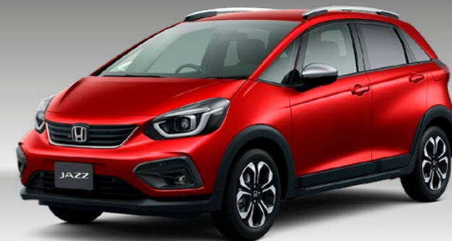
PREMIUM CRYSTAL RED METALLIC