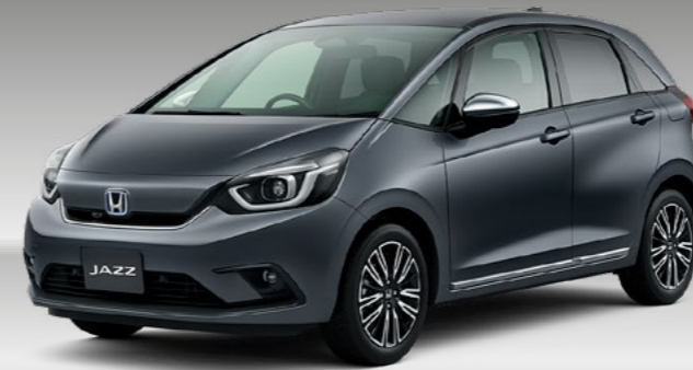
METEOROID GREY METALLIC