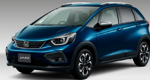
MIDNIGHT BLUE METALLIC