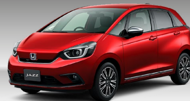
PREMIUM CRYSTAL RED METALLIC