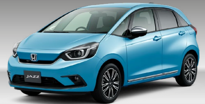
WIND BLUE METALLIC