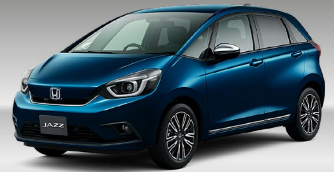
MIDNIGHT BLUE METALLIC