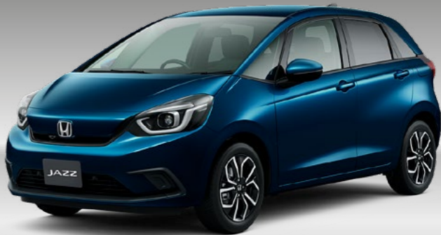
MIDNIGHT BLUE METALLIC