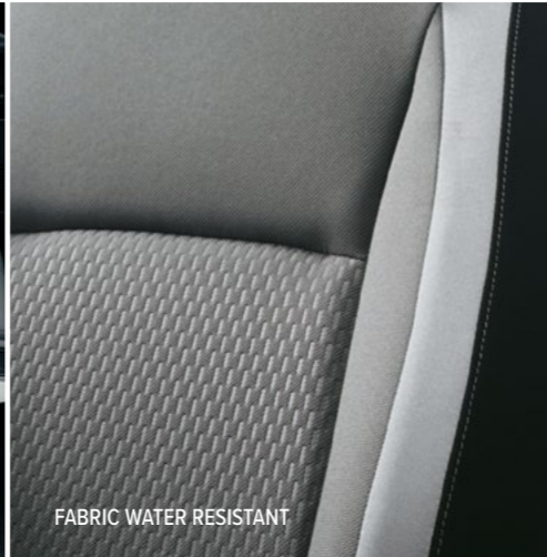
FABRIC WATER RESISTANT