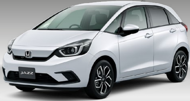
PLATINUM WHITE PEARL