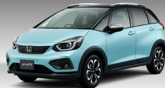
SURF BLUE / TWO-TONE