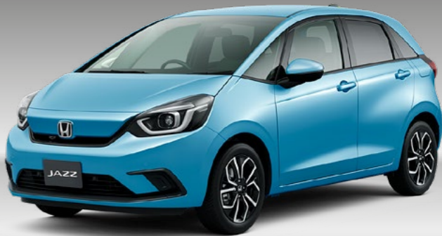
WIND BLUE METALLIC