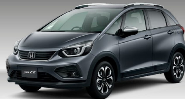
METEOROID GREY METALLIC