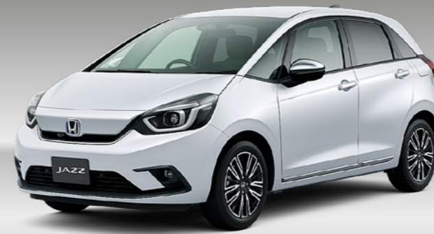
PLATINUM WHITE PEARL