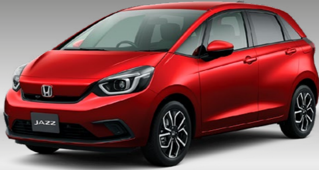
PREMIUM CRYSTAL RED METALLIC