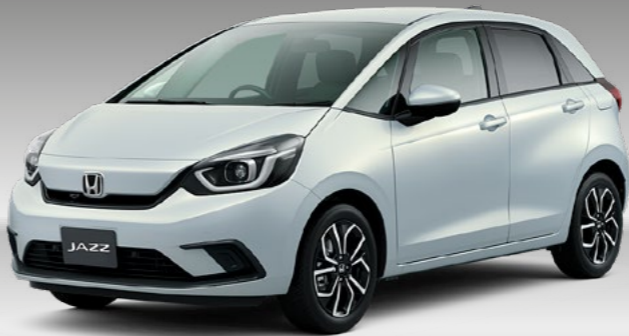
PREMIUM OPAL PEARL