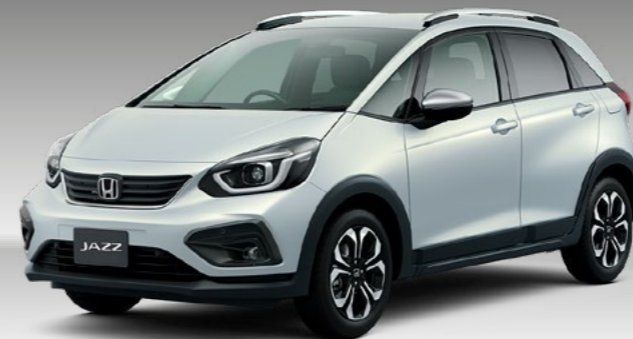
PREMIUM OPAL PEARL