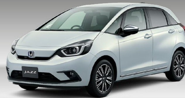
PREMIUM OPAL PEARL