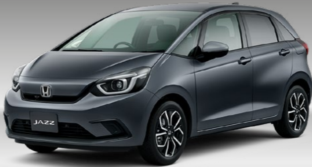
METEOROID GREY METALLIC